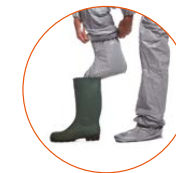
Also available with socks