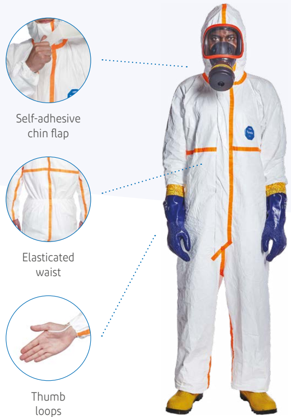
Self-adhesive chin flap