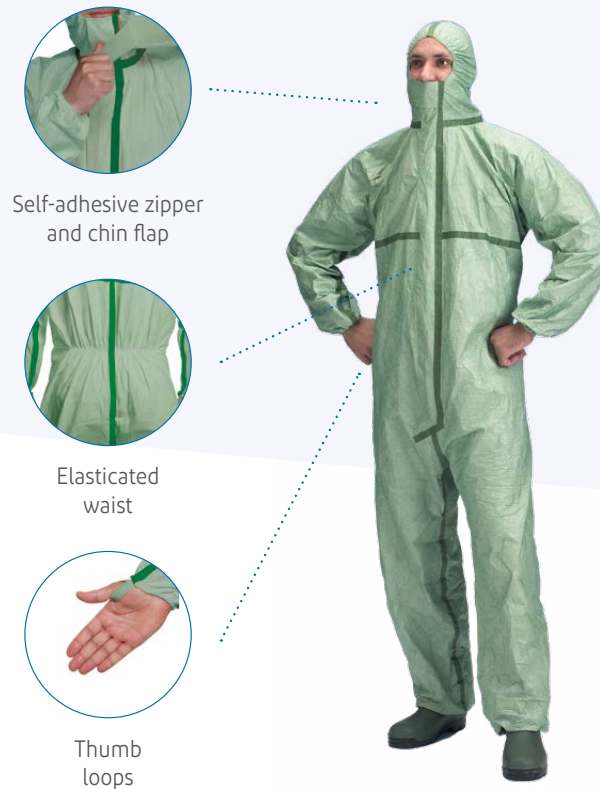
Self-adhesive zipper and chin flap