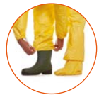
Elastics at ankle closures