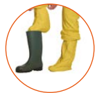
Also available with socks