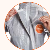
Self-adhesive chin and zipper flap