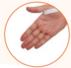
Wrist closures with elastic